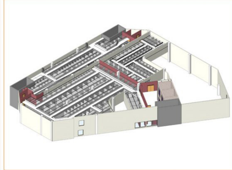
Figure 4: Floor plan and rendering of a self-storage facility with wine storage. Architectural Design. Steel Storage . Web.

junkyards, overflowing landfills, and exported garbage.<sup>55</sup> The average U.S. person now consumes twice as much as they did 50 years ago.<sup>56</sup> The average U.S. house size has doubled since the 1970s,<sup>57</sup> the average family size got smaller,<sup>23</sup> yet Americans seem to have an unquenchable thirst for space. The notion of self-storage is aligned with the principle that it's the accumulation of things that defines you as an American and that throwing anything away is wasteful. The self-storage industry reconciles these opposing values: paying for storage is, paradoxically, thrifty.<sup>27</sup>