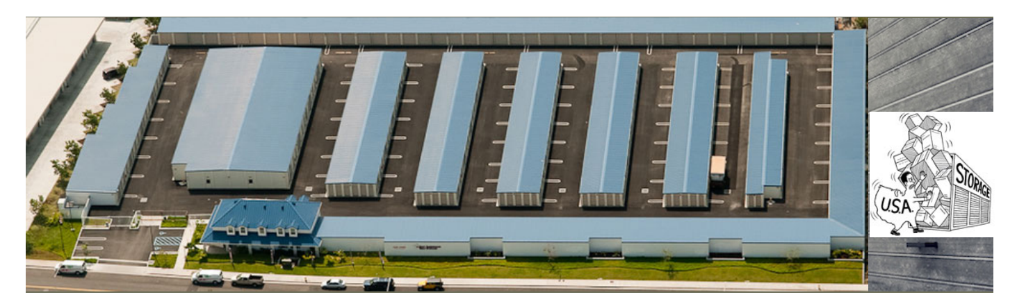
Figure 1: Less Mess Storage Inc. in Canada. US Self Storage. Web. Figure 2: Illustration from "Self-Storage Nation". Slate . Web