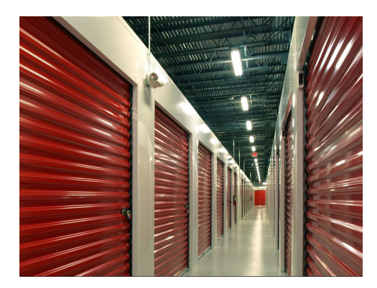
Figure 3: A Self Storage Interior - The Catacombs of Consumerism . Interior Standard Storage Units in Washington, PA. Guardian Storage . Web.

opened in El Cajon, California (fittingly, el cajon is Spanish for 'the big box' or 'drawer') and self-storage boomed into a large-scale industry.